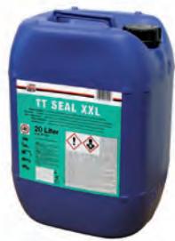
593 1252 TT SEAL XXL 20 l PE-barrel