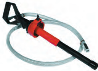
593 1277 TT SEAL XXL hand pump