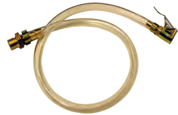
593 1284 Valve adapter